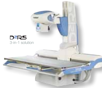
STATIF PRO DREAM Universal systems