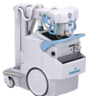
MOVIX SERIES DREAM Mobile X-ray units