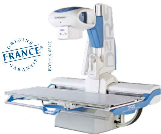
D2RS Dynamic Imaging