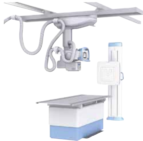
XTREME General X-Ray Rooms