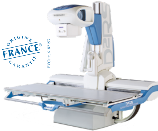
D2RS Dynamic Imaging